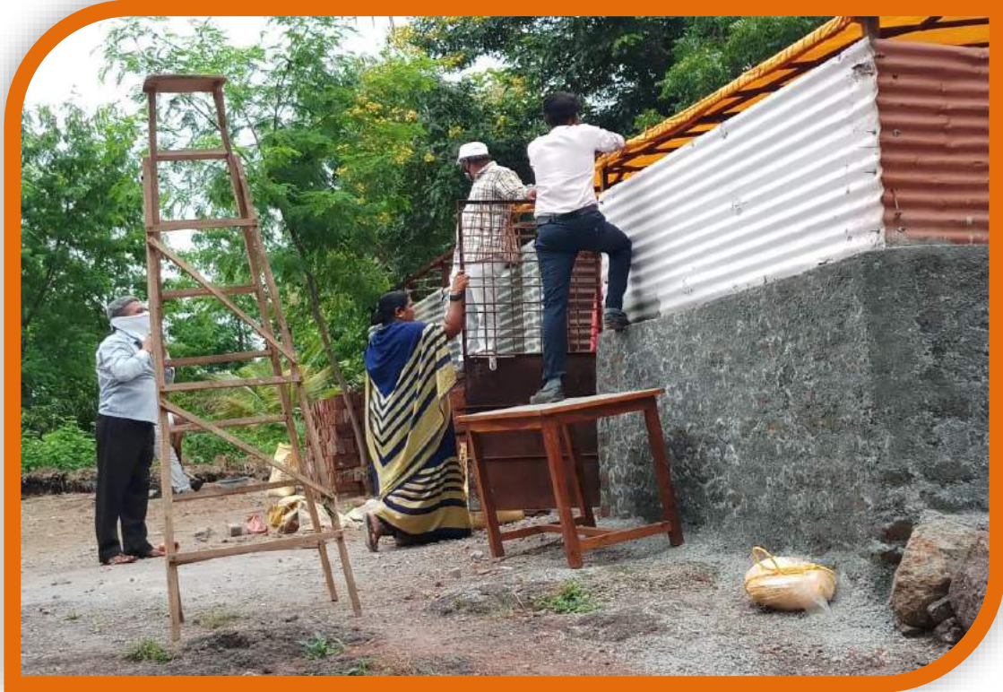
DAILY WAGES WORKERS

4.4.2 - There are established systems and procedures for maintaining and utilizing physical, academic and support facilities - laboratory, library, sports complex, computers, classrooms etc.