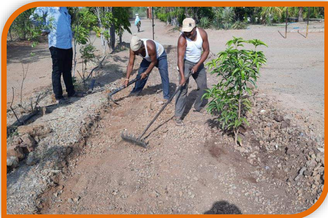
DAILY WAGES WORKERS