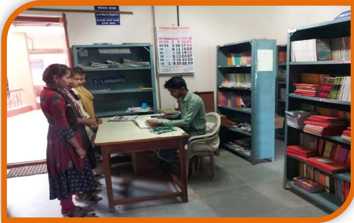
LIBRARY CIRCULATION UNIT

4.4.2 - There are established systems and procedures for maintaining and utilizing physical, academic and support facilities - laboratory, library, sports complex, computers, classrooms etc.